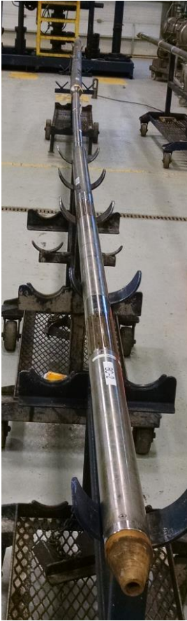
Figure 1: The BHG tool in the foreground with a well tractor.

The BHG tools operate on a single conductor cable. There are sufficient extra conductors in a seven conductor cable to run the BHG tool “beneath” a well tractor (Figure 1). Typically the tractor pushes the BHG tool to the end of the horizontal section of the well and gravity is measured as the tool is retrieved using the wireline.